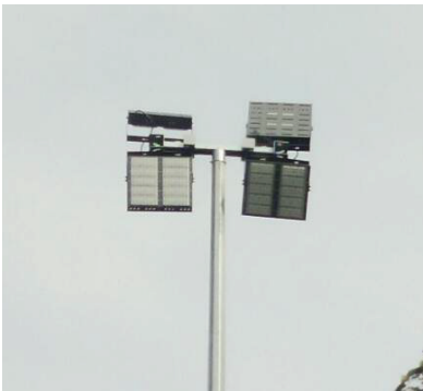
Headframe 4 Nos Floodlight