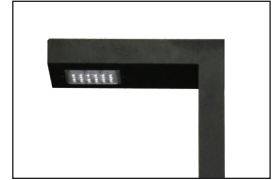
Optional for Tilting Angle 10°